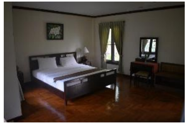
Pai - nights 8 and 9 - 4*

Belle Villa Resort (or similar) – around 2km outside the town of Pai and set in a quiet area with a lovely rural feeling, this resort is a great location to unwind. All the rooms are individual cottage style and a short walk to the restaurant and swimming pool. Perfect for both putting your feet up and also heading into the town to explore the markets and great food on offer