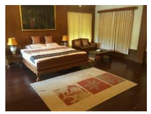
Mae Khlang Luang – nights 3 and 4 – 2*

You'll stay in the Karen Hill Tribe village of Mae Khlang Luang. Whilst this is the 'simplest' accommodation of the adventure the rooms are spacious, clean and, being situated overlooking the rice terraces, in a superb location. All the rooms have en-suite facilities, hot water and are fancooled – there's no need for air-conditioning this high in the mountains.