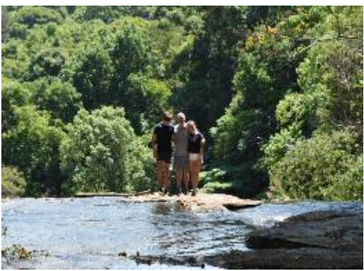
NOTE – the hike is suitable for all. The total distance is around 5-6km, we take it at a gentle place and after the initial uphill section, the majority of the hike is flat or downhill

This evening it's time for another superb Thai feast – again overlooking the rice terraces – and perhaps one or two well deserved cold beers!